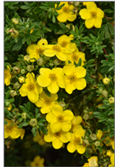
Happy Face Yellow Potentilla flowers

This is a relatively low maintenance shrub, and is best pruned in late winter once the threat of extreme cold has passed. It is a good choice for attracting butterflies to your yard, but is not particularly attractive to deer who tend to leave it alone in favor of tastier treats. It has no significant negative characteristics.