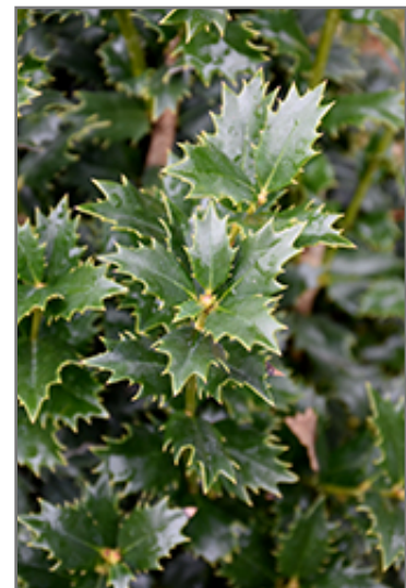
Acadiana Holly foliage