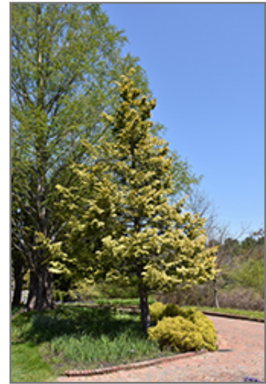
Cripps Gold Falsecypress

This tree does best in full sun to partial shade. It prefers to grow in average to moist conditions, and shouldn't be allowed to dry out. It is not particular as to soil type or pH. It is highly tolerant of urban pollution and will even thrive in inner city environments, and will benefit from being planted in a relatively sheltered location. Consider applying a thick mulch around the root zone in winter to protect it in exposed locations or colder microclimates. This is a selected variety of a species not originally from North America.