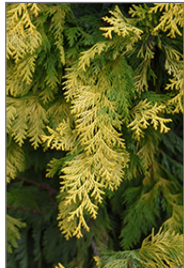
Cripps Gold Falsecypress foliage