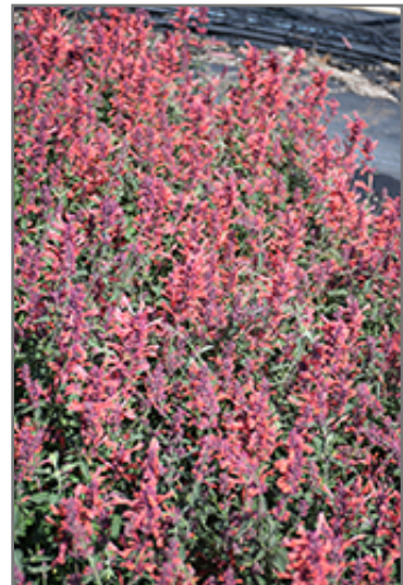
Kudos Coral Hyssop in bloom