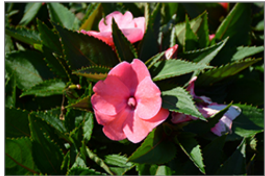
SunPatiens Spreading Shell Pink New Guinea Impatiens flowers

SunPatiens Spreading Shell Pink New Guinea Impatiens is recommended for the following landscape applications;