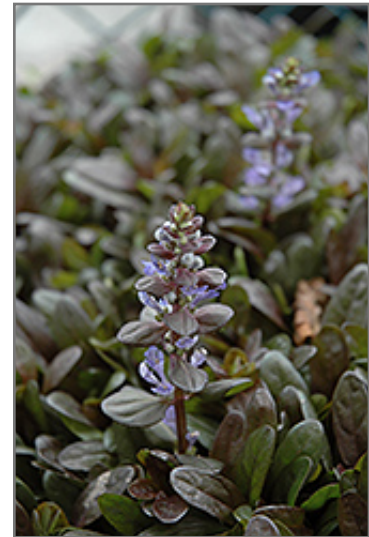
Chocolate Chip Bugleweed flowers

Chocolate Chip Bugleweed is recommended for the following landscape applications;