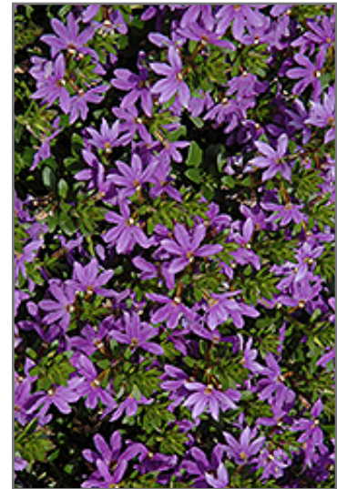
Brilliant Fan Flower flowers