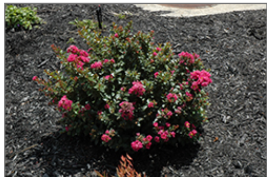
Berry Dazzle Crapemyrtle in bloom