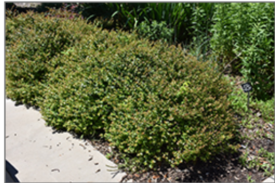
Rose Creek Abelia