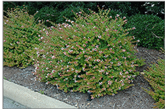
Rose Creek Abelia in bloom

Rose Creek Abelia is a multi-stemmed evergreen shrub with a mounded form. Its average texture blends into the landscape, but can be balanced by one or two finer or coarser trees or shrubs for an effective composition.