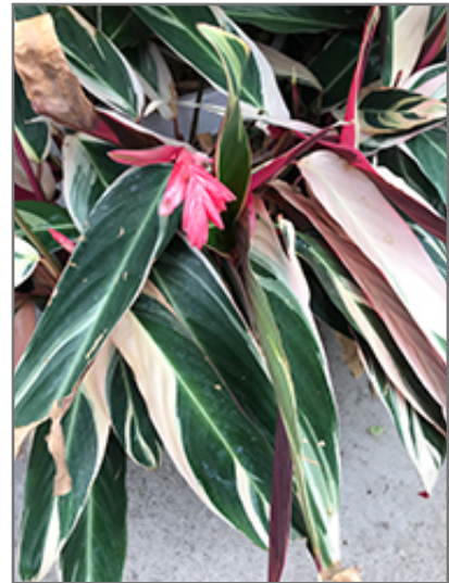
Tricolor Stromanthe flowers

This plant is native to the tropics and prefers growing in moist environments with evenly warm conditions all year round. In our climate, it is usually grown as an outdoor annual in the garden or in a container. If you want it to survive the winter, it can be brought in to the house and provided with special care, and then returned to the garden the following season. In its preferred tropical habitat, it can grow to be around 3 feet tall at maturity, with a spread of 3 feet. However, when grown as an annual or when overwintered indoors, it can be expected to perform differently, and its exact height and spread will depend on many factors; you may wish to consult with our experts as to how it might perform in your specific application and growing conditions.