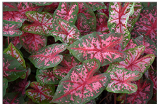
Carolyn Whorton Caladium foliage