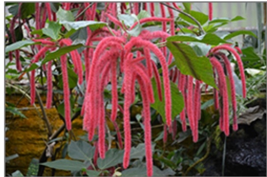
Firetail Chenille Plant flowers

Firetail Chenille Plant is recommended for the following landscape applications;