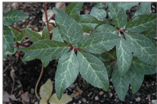
Merlin Hellebore foliage