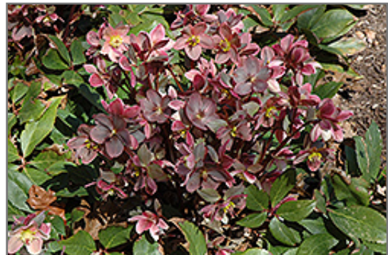
Pink Frost Hellebore in bloom