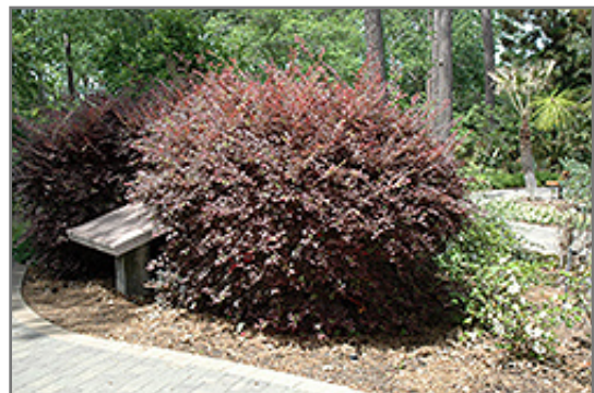
Daruma Chinese Fringeflower