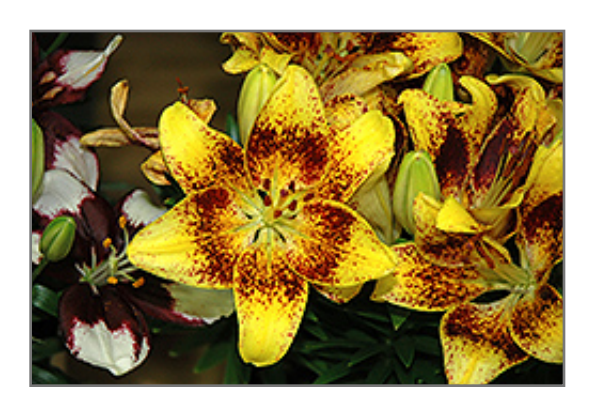
Lily Looks Tiny Nugget Lily flowers

Lily Looks Tiny Nugget Lily is recommended for the following landscape applications;