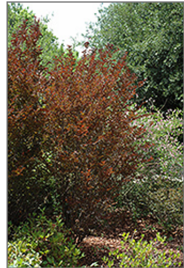
Cherry Dazzle Crapemyrtle

Cherry Dazzle Crapemyrtle makes a fine choice for the outdoor landscape, but it is also well-suited for use in outdoor pots and containers. Because of its height, it is often used as a 'thriller' in the 'spiller-thriller-filler' container combination; plant it near the center of the pot, surrounded by smaller plants and those that spill over the edges. It is even sizeable enough that it can be grown alone in a suitable container. Note that when grown in a container, it may not perform exactly as indicated on the tag - this is to be expected. Also note that when growing plants in outdoor containers and baskets, they may require more frequent waterings than they would in the yard or garden.