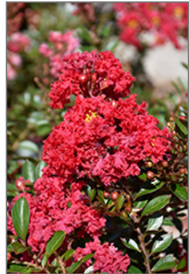
Cherry Dazzle Crapemyrtle flowers

This shrub will require occasional maintenance and upkeep. Trim off the flower heads after they fade and die to encourage more blooms late into the season. It has no significant negative characteristics.