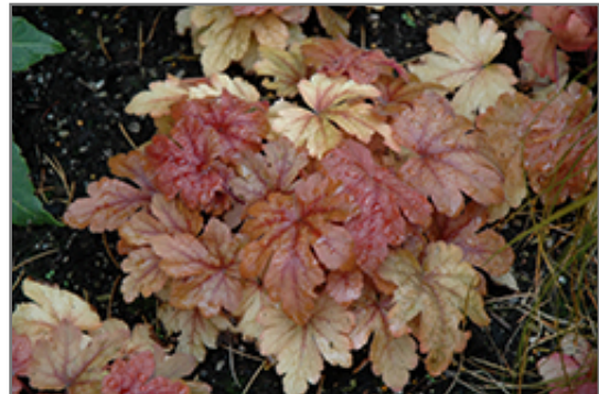
Buttered Rum Foamy Bells

This is a relatively low maintenance plant, and should be cut back in late fall in preparation for winter. It is a good choice for attracting hummingbirds to your yard. It has no significant negative characteristics.