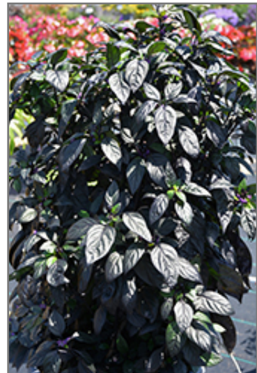
Black Pearl Ornamental Pepper