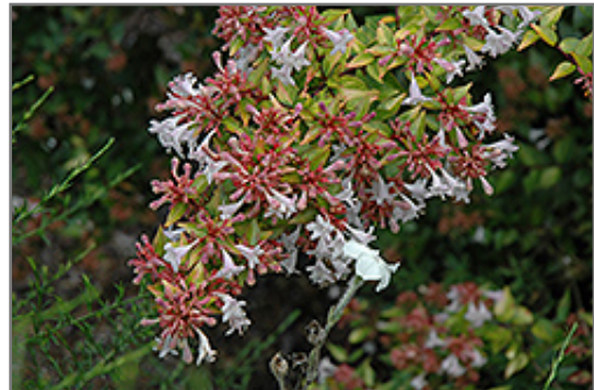
Francis Mason Abelia flowers

This shrub will require occasional maintenance and upkeep, and should only be pruned after flowering to avoid removing any of the current season's flowers. It is a good choice for attracting birds, bees and butterflies to your yard, but is not particularly attractive to deer who tend to leave it alone in favor of tastier treats. It has no significant negative characteristics.