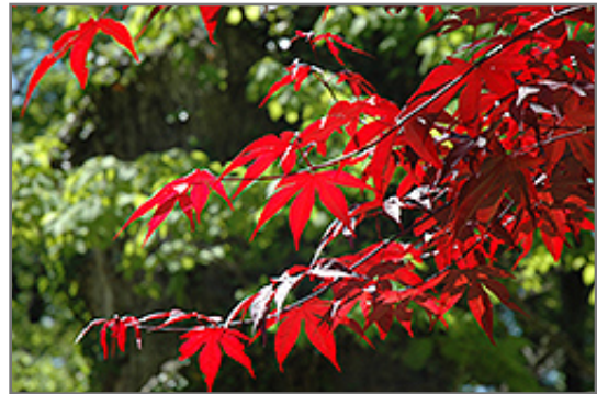
Emperor I Japanese Maple foliage

This tree does best in full sun to partial shade. You may want to keep it away from hot, dry locations that receive direct afternoon sun or which get reflected sunlight, such as against the south side of a white wall. It prefers to grow in average to moist conditions, and shouldn't be allowed to dry out. It is not particular as to soil pH, but grows best in rich soils. It is somewhat tolerant of urban pollution, and will benefit from being planted in a relatively sheltered location. Consider applying a thick mulch around the root zone in winter to protect it in exposed locations or colder microclimates. This is a selected variety of a species not originally from North America.