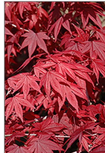
Emperor I Japanese Maple foliage