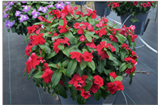
Titan Dark Red Vinca in bloom

Titan Dark Red Vinca is a fine choice for the garden, but it is also a good selection for planting in outdoor containers and hanging baskets. It is often used as a 'filler' in the 'spiller-thriller-filler' container combination, providing a mass of flowers against which the thriller plants stand out. Note that when growing plants in outdoor containers and baskets, they may require more frequent waterings than they would in the yard or garden.