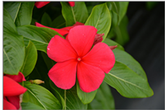
Titan Dark Red Vinca flowers

This plant will require occasional maintenance and upkeep, and should not require much pruning, except when necessary, such as to remove dieback. It is a good choice for attracting butterflies to your yard, but is not particularly attractive to deer who tend to leave it alone in favor of tastier treats. It has no significant negative characteristics.