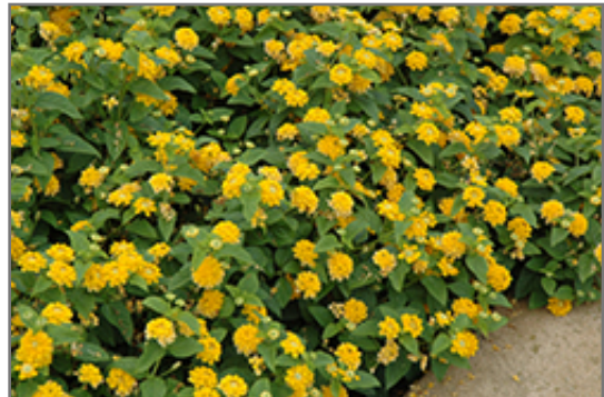
Little Lucky Pot Of Gold Lantana flowers

Little Lucky Pot Of Gold Lantana is recommended for the following landscape applications;