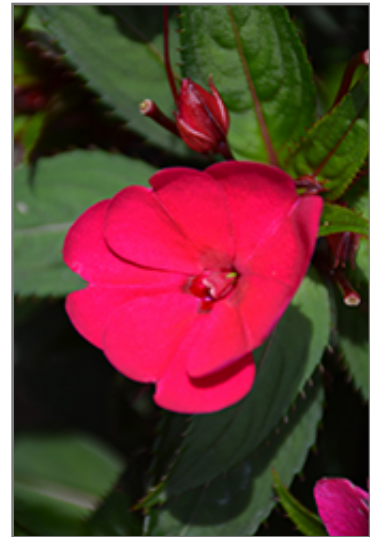
SunPatiens Compact Royal Magenta New Guinea Impatiens flowers

SunPatiens Compact Royal Magenta New Guinea Impatiens is a dense herbaceous annual with a mounded form. Its medium texture blends into the garden, but can always be balanced by a couple of finer or coarser plants for an effective composition.