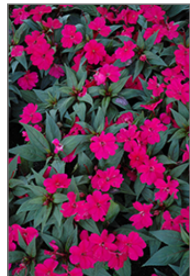
SunPatiens Compact Royal Magenta New Guinea Impatiens flowers