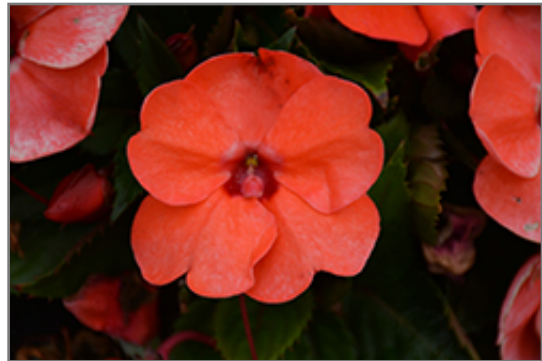
SunPatiens Compact Hot Coral New Guinea Impatiens flowers

SunPatiens Compact Hot Coral New Guinea Impatiens is a dense herbaceous annual with a mounded form. Its medium texture blends into the garden, but can always be balanced by a couple of finer or coarser plants for an effective composition.