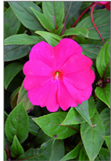
Divine Violet New Guinea Impatiens flowers

This plant will require occasional maintenance and upkeep, and should not require much pruning, except when necessary, such as to remove dieback. It has no significant negative characteristics.