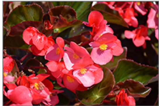
Whopper Rose Bronze Leaf Begonia flowers

Whopper Rose Bronze Leaf Begonia is an herbaceous annual with an upright spreading habit of growth. Its medium texture blends into the garden, but can always be balanced by a couple of finer or coarser plants for an effective composition.