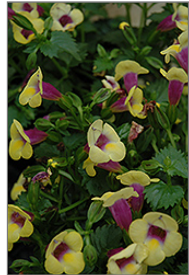
Yellow Moon Torenia flowers

This plant will require occasional maintenance and upkeep, and should not require much pruning, except when necessary, such as to remove dieback. It is a good choice for attracting bees and hummingbirds to your yard, but is not particularly attractive to deer who tend to leave it alone in favor of tastier treats. It has no significant negative characteristics.