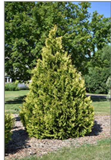
Yellow Ribbon Arborvitae