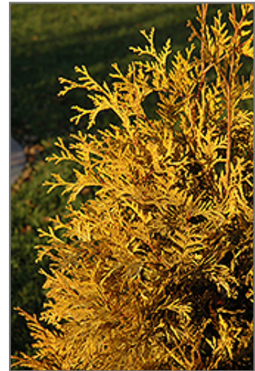
Yellow Ribbon Arborvitae in fall

This shrub does best in full sun to partial shade. It prefers to grow in average to moist conditions, and shouldn't be allowed to dry out. It is not particular as to soil type or pH. It is somewhat tolerant of urban pollution, and will benefit from being planted in a relatively sheltered location. Consider applying a thick mulch around the root zone in winter to protect it in exposed locations or colder microclimates. This is a selection of a native North American species.