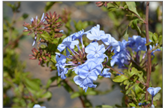
Imperial Blue Plumbago flowers

Imperial Blue Plumbago is recommended for the following landscape applications;