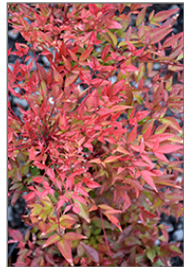
Obsession Nandina foliage

Obsession Nandina is recommended for the following landscape applications;