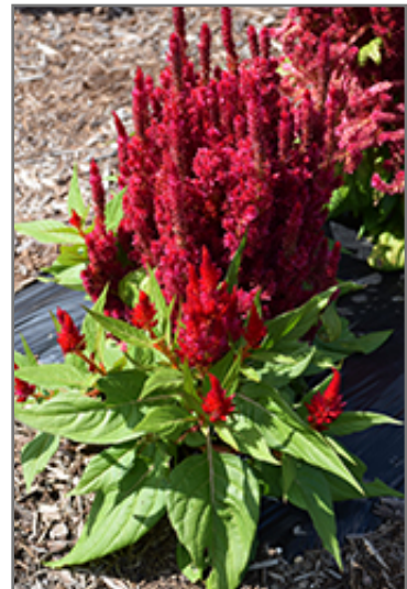
Fresh Look Red Celosia in bloom