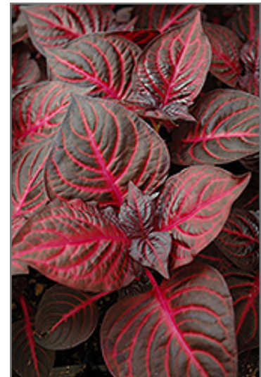
Blazin' Rose Blood Leaf foliage