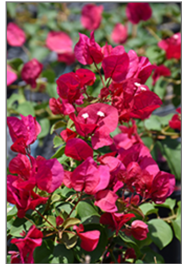
Barbara Karst Bougainvillea flowers

Barbara Karst Bougainvillea is recommended for the following landscape applications;