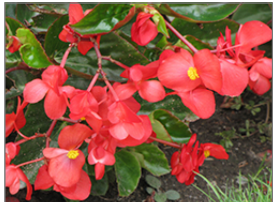
Dragon Wing Red Begonia flowers

Dragon Wing Red Begonia is an herbaceous annual with a trailing habit of growth, eventually spilling over the edges of hanging baskets and containers. Its medium texture blends into the garden, but can always be balanced by a couple of finer or coarser plants for an effective composition.