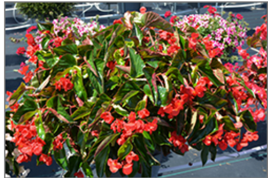
Dragon Wing Red Begonia in bloom