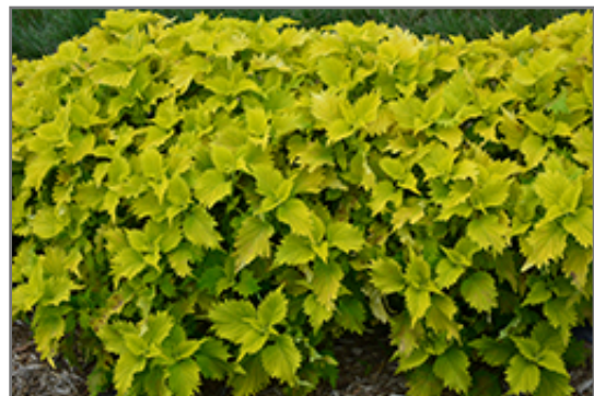
Wasabi Coleus