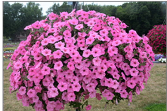
Supertunia Vista Bubblegum Petunia in bloom

Supertunia Vista Bubblegum Petunia will grow to be about 18 inches tall at maturity, with a spread of 24 inches. When grown in masses or used as a bedding plant, individual plants should be spaced approximately 20 inches apart. Its foliage tends to remain dense right to the ground, not requiring facer plants in front. This fast-growing annual will normally live for one full growing season, needing replacement the following year.