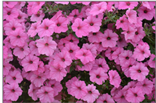
Supertunia Vista Bubblegum Petunia flowers

Supertunia Vista Bubblegum Petunia is recommended for the following landscape applications;