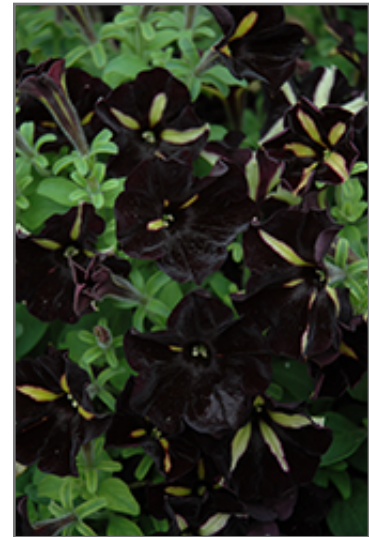
Phantom Petunia flowers