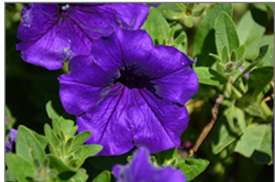
Easy Wave Blue Petunia flowers