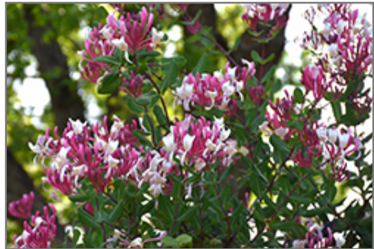
Peaches And Cream Honeysuckle flowers

Peaches And Cream Honeysuckle will grow to be about 20 feet tall at maturity, with a spread of 24 inches. As a climbing vine, it tends to be leggy near the base and should be underplanted with low-growing facer plants. It should be planted near a fence, trellis or other landscape structure where it can be trained to grow upwards on it, or allowed to trail off a retaining wall or slope. It grows at a medium rate, and under ideal conditions can be expected to live for approximately 20 years.