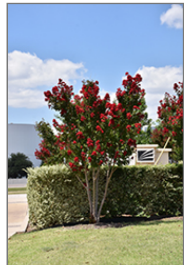
Dynamite Crapemyrtle in bloom