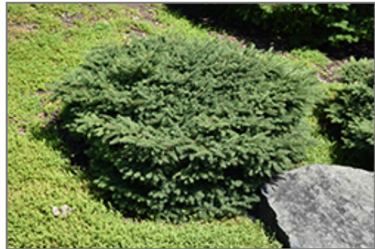
Birds Nest Spruce

Birds Nest Spruce is recommended for the following landscape applications;